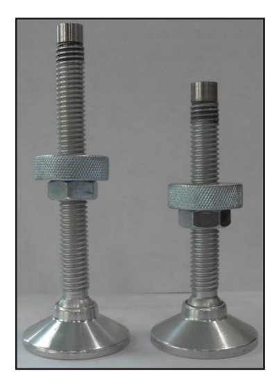
3" feet are intended for the spanners